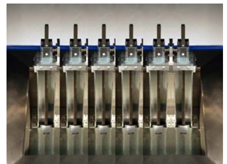
Fig. 3: Modular design of multi-elevator freezer. Six freezing and thawing units.