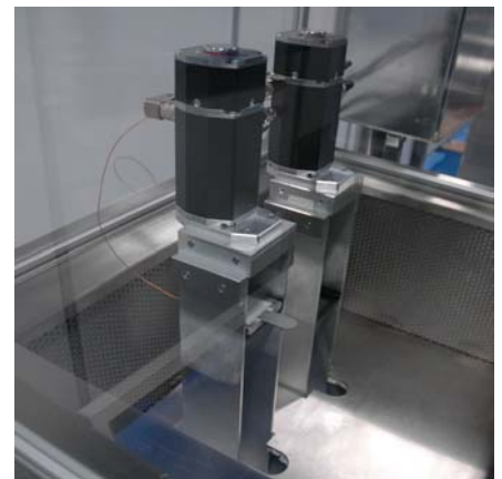
Fig. 2: "Two elevator" Freezer mounted in a cover system to work under dry nitrogen atmosphere. Any ice formation on substrate or other parts is avoided.