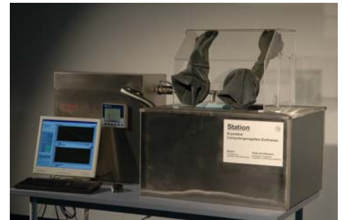
Fig. 1: High Precision Cell Freezer with cover technology (acrylic glass hood) in order to prevent frost and ice formation on the surfaces for thermoregulation of up to 0.1 °C precision.

Are you looking for cryofreezers with high precision thermoregulation for research or application? The IBMT development is a quality improvement for research and production of cryosamples.