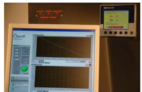
Fig. 3: PC software and PID controller.